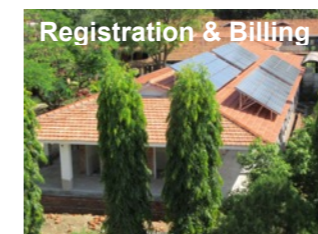
Registration & Billing