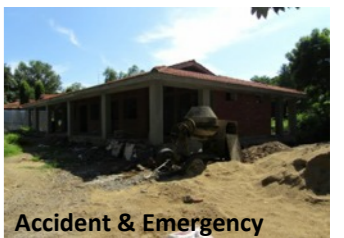
Accident & Emergency