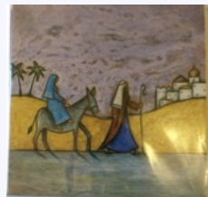
The road to Bethlehem