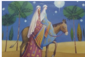
Journey to Bethlehem