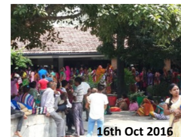
16th Oct 2016

At Lalgadh, the new buildings have been going up fast, and the new registration and consultation block is nearly ready for action. This is just as well, since the numbers of patients attending has been growing steadily. On 16th October there was a record 904 patient visits, putting a considerable strain on existing facilities which were never designed for such numbers. The new buildings will make it easier to handle large numbers, and the patients will have an easier time too, with less waiting and a more comfortable environment. The new pharmacy unit is already open and provides 3 service windows for patients. Other new buildings include a small A&E unit, an expanded laboratory, a new footwear and prosthetics unit, and a new children's ward. We are so grateful to the various donors who have made this expansion possible. Please pray that work will be completed soon, so that NLT can receive and serve the many needy patients coming for help in a good and effective way.