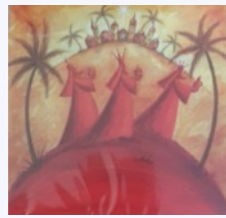
Gifts from afar

Large: £4.00 per pack of 10 Small: £3.50 per pack of 10