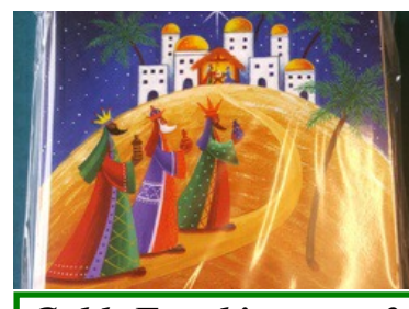
Gold. Frankincense & Myrrh